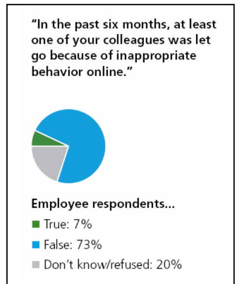
Pie chart 3