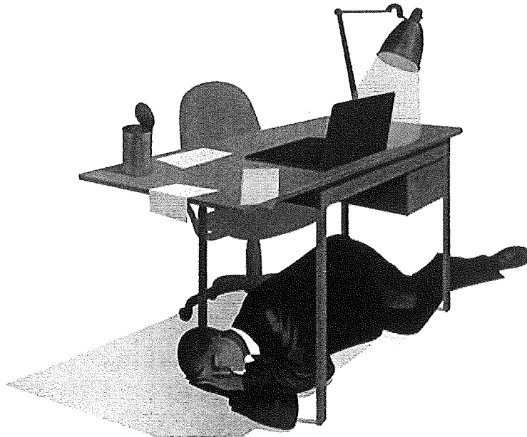
Illustration of the text above